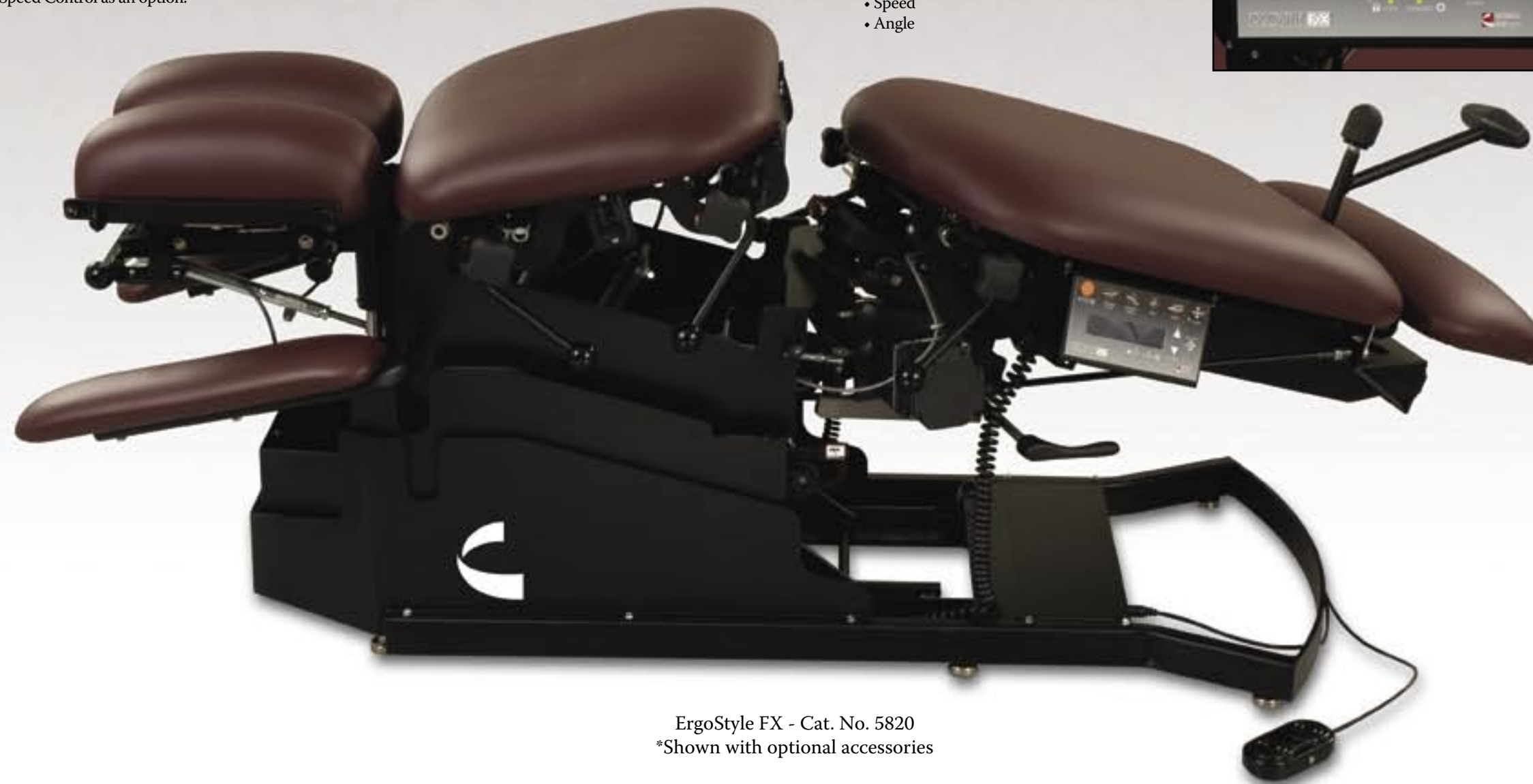
ErgoStyle FX - Cat. No. 5820 *Shown with optional accessories

Accelerator III is our newest design. Continuing on our quest for the perfect drop, we took the challenge head on. Quieter, quicker and still the world's first and only modular drop design. No dead spots or surprises. Our drops will accelerate faster with increased tension, unlike our competitors who make you work harder when the drop is under tension. Our patented design looks and performs like no other in the world. ErgoStyle drops are tested to perform flawlessly, at a price you won't believe! Now available with Auto Air Cocking Drops with Speed Control as an option.